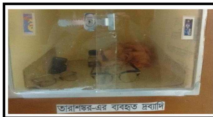
Various Items used by Tarasankar Bandyopadhyay